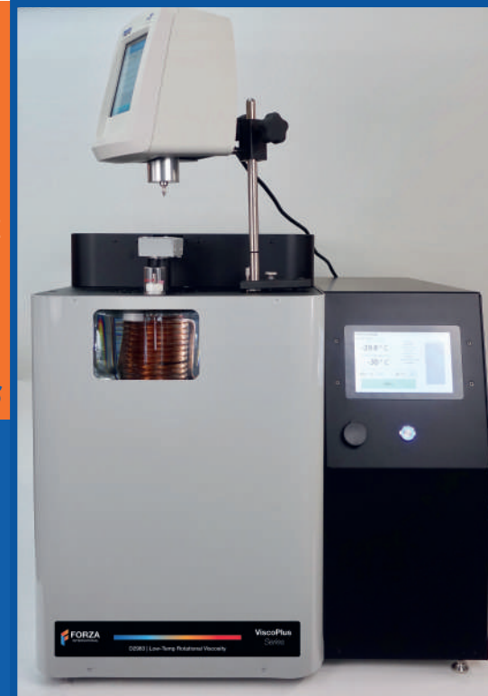
Model: LTRV-D2983-L-10 | 10 Test positions